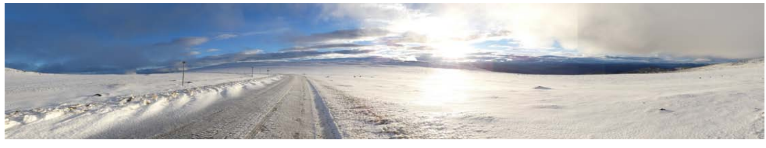
Panorama from the 'Peace Plateau' November 12th 2018 at 15:28 hrs.

Work is going on to repair the so-called "Forest House" ("Skauhuset") and turn it into a Baral museum. Last year an expert from the Røros Museum surveyed the house and wrote a report with a cost estimate. He estimated the total cost at about 1,205,000 NOK, which is based on a repair to simple standard emphasising preservation before making changes. This spring the national Fund for Cultural Monuments granted 370,000 NOK to the project, whereas the municipality of Alvdal turned down our application for support. We are awaiting an answer from the county administration who recently received our application, and several more bodies will be approached for the financing of the project.