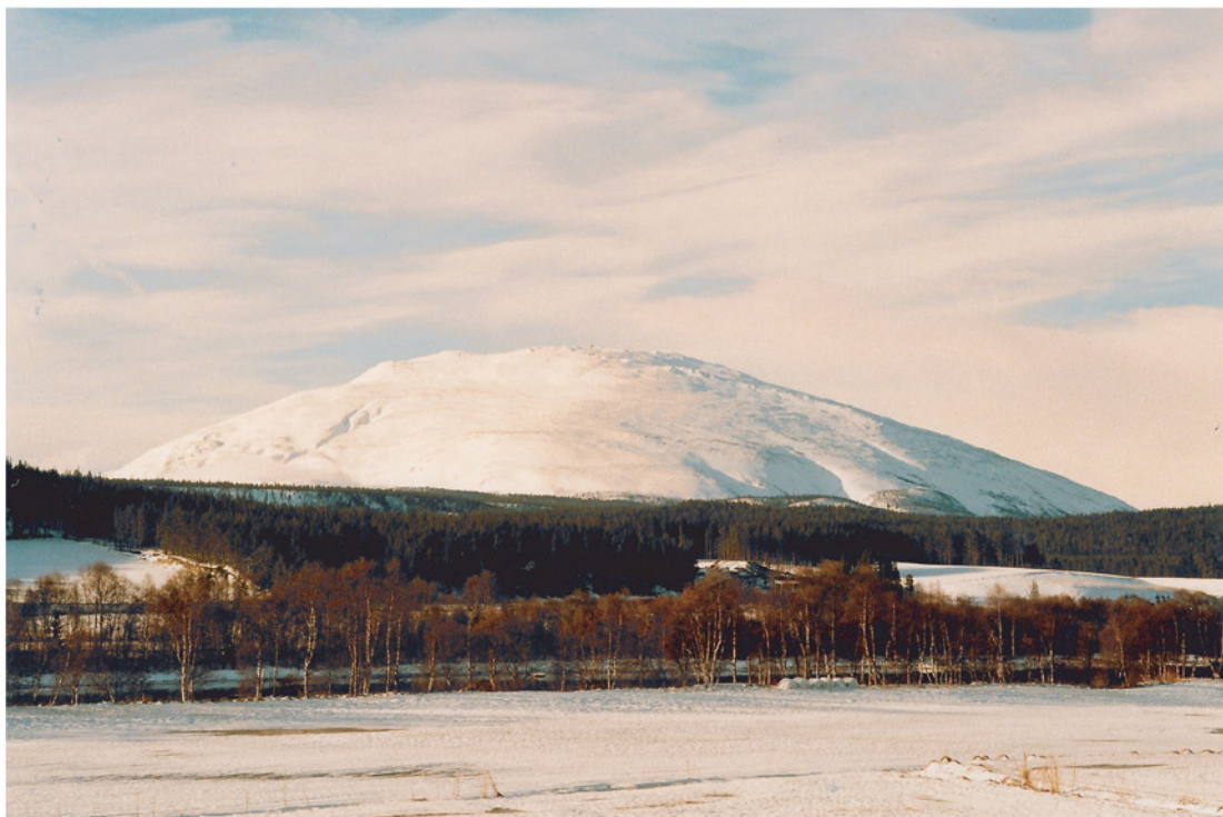
Mt. Tron in morning sun, seen from Telneset, Tynset, March 1999.