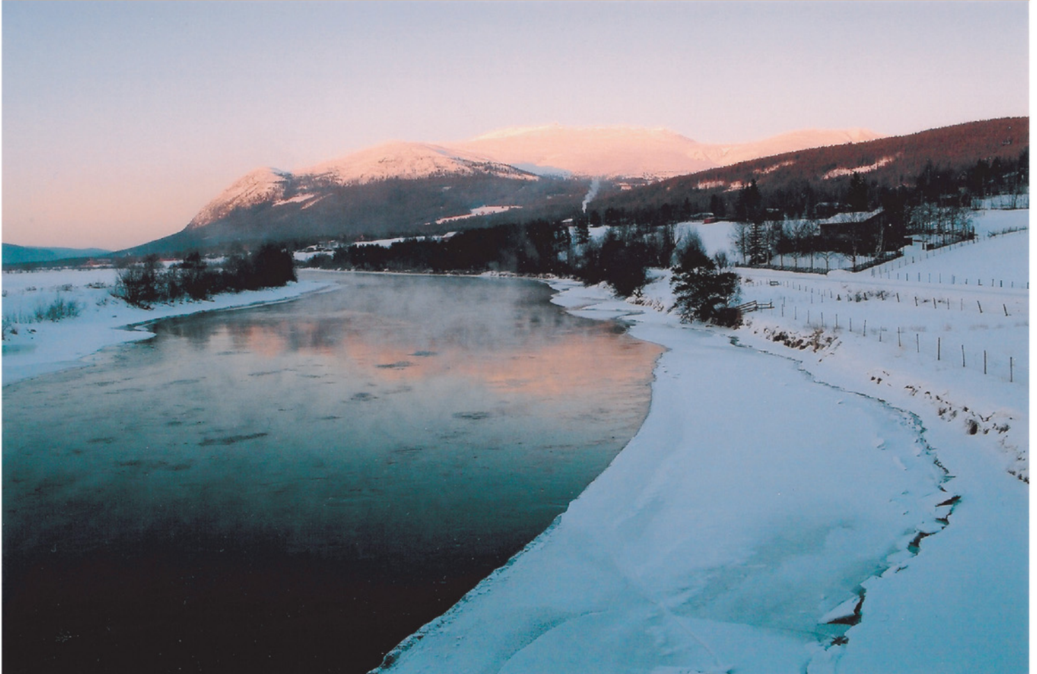
Mt. Tron reflected in the river while the evening sun reflects off its snowy peak, one cold evening towards the end of February 2005.

March 2005 • Mt. Tron University of Peace Foundation • No. 1 Vol. 8