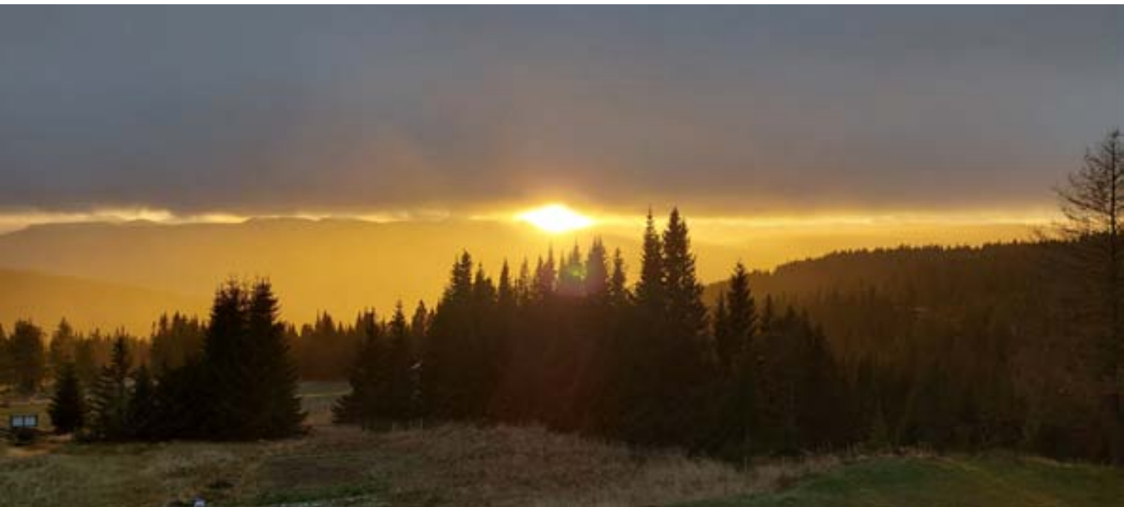
Below: Sunset below the cloud cap makes all of Alvdal disappear into magical gold dust! November 3rd 2024.

The Mt.Tron Mail - the newsletter for those interested in the establishing of the Mt.Tron University of Peace