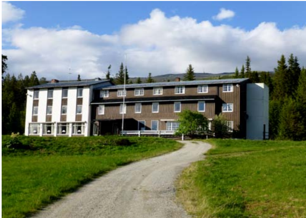
Tronsvangen Seter at Tronsvangen at Alvdal.

On January 10th this year Tronsvangen Seter Operation Inc was registered at Frivillighetsregisteret (the registry of voluntariness) at Brønnøysundregistrene (the national registries). This is not very common for a limited company, but by a change of the statutes it became possible. The company's statutes § 3, second and third paragraph, shows why: