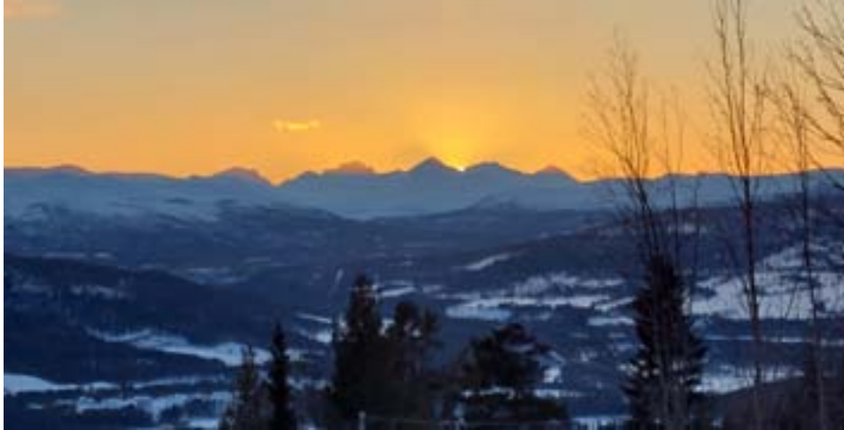
Above: Sunset behind Rondane on February 17th this year, as seen from Tronsvangen Seter.

We will also have a look at the overall organizing of Tronsvangen Seter in relation to The University of Peace, with a new board and share issue / capital increase at Tronsvangen Seter Operation Inc. – something that has been a process of formalization over several years.