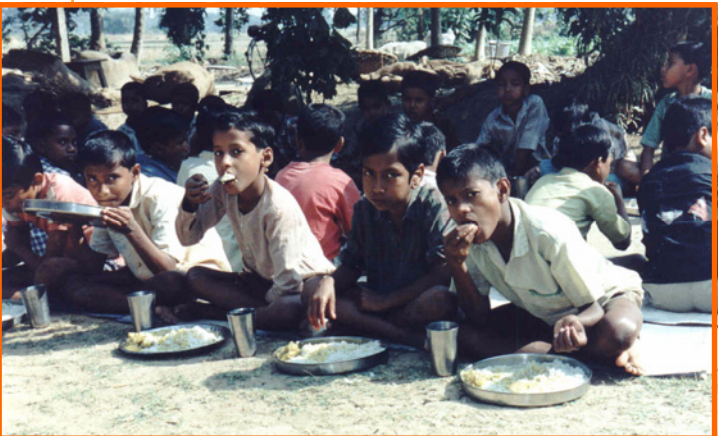
Orphans at Paramananda Mission, Banagram, West-Bengal, India. The photos are from January 1995. Since then a large kitchen cum dininghall has been built for the children.