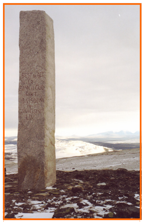
The Monument on the Peace Plateau. 15th of November 1999.

Alvdal has been given a grand and attractive project for free and without much self-effort. The Foundation has been patient for a long time. The municipality should take action now!