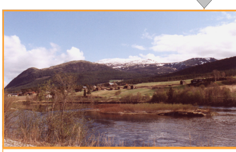
Mt.Tron with the river Glåma in front, May-98.

Alvdal council has now accepted the plans of the Aviation authorities to raise a building of ca. 200 square metres with a 20 metre high tower for radar on the top of Mt.Tron. The building will be made of concrete with insulation and a wooden covering on the outside. The