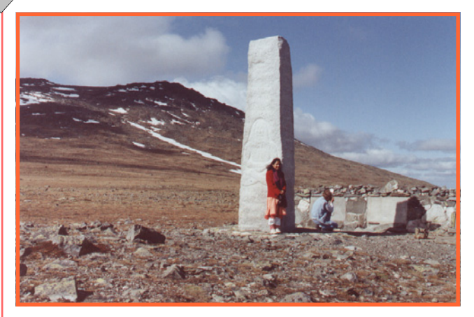
The Monument on Mt.Tron, which is the foundation stone of the University. Photo: BP, June 1993.

The Foundation can begin to collect donations after building permission has been granted, but in the meantime work continues with the plans.