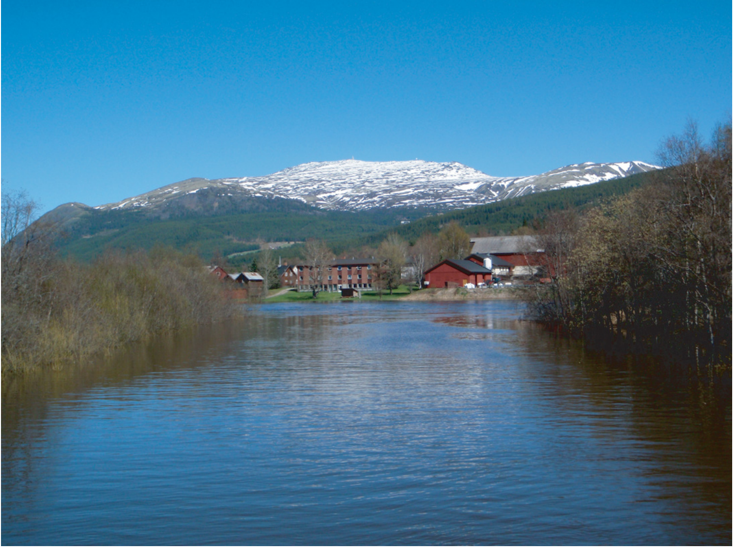
Mt. Tron seen from a bridge where the two rivers Glåma and Folla meet, near the centre of Alvdal on May 21st 2010. In the foreground the Storsteigen agricultural school.

June 2010 • Mt.Tron University of Peace Foundation • No. 1 Vol. 13