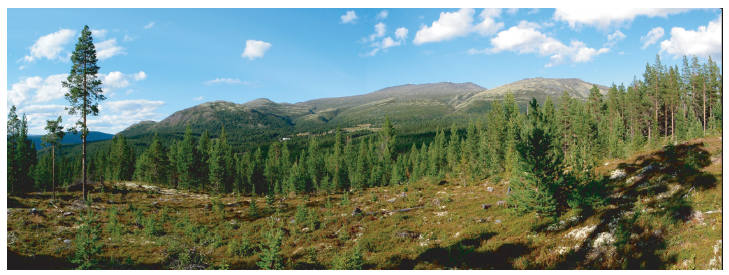
A panorama photo of Mt.Tron seen from Tronsvanglia, 24th August 2008.

If you know that you are not your physical body, and that you are nothing of all that your mind contains, either your thoughts, feelings, wishes or wills, but that all these are only something you have in order to experience life. - If you acknowledge that, even if all of your body cells have been replaced and renewed many times, and even if you have changed your opinions, attitude, feelings and perhaps even your nature many times during your life, your "I-feeling" beyond everything has never ever changed - because you feel yourself exactly the same to-day as you have always done as long as you can remember. - If you experience that you, in spite of intense ups and downs, hardships and ease, joys and sorrows in life, are not carried away or overturned but keep your composure and perspective, and at the same time experiences that your life becomes more and more focused and conscious. - If you love God (the All - the Absolute), your Self and your neighbour (all living creatures) in equal high measure and with all your heart and mind and soul. - Yes, then you realize your Self and enjoy freely this ever-wondrous life!