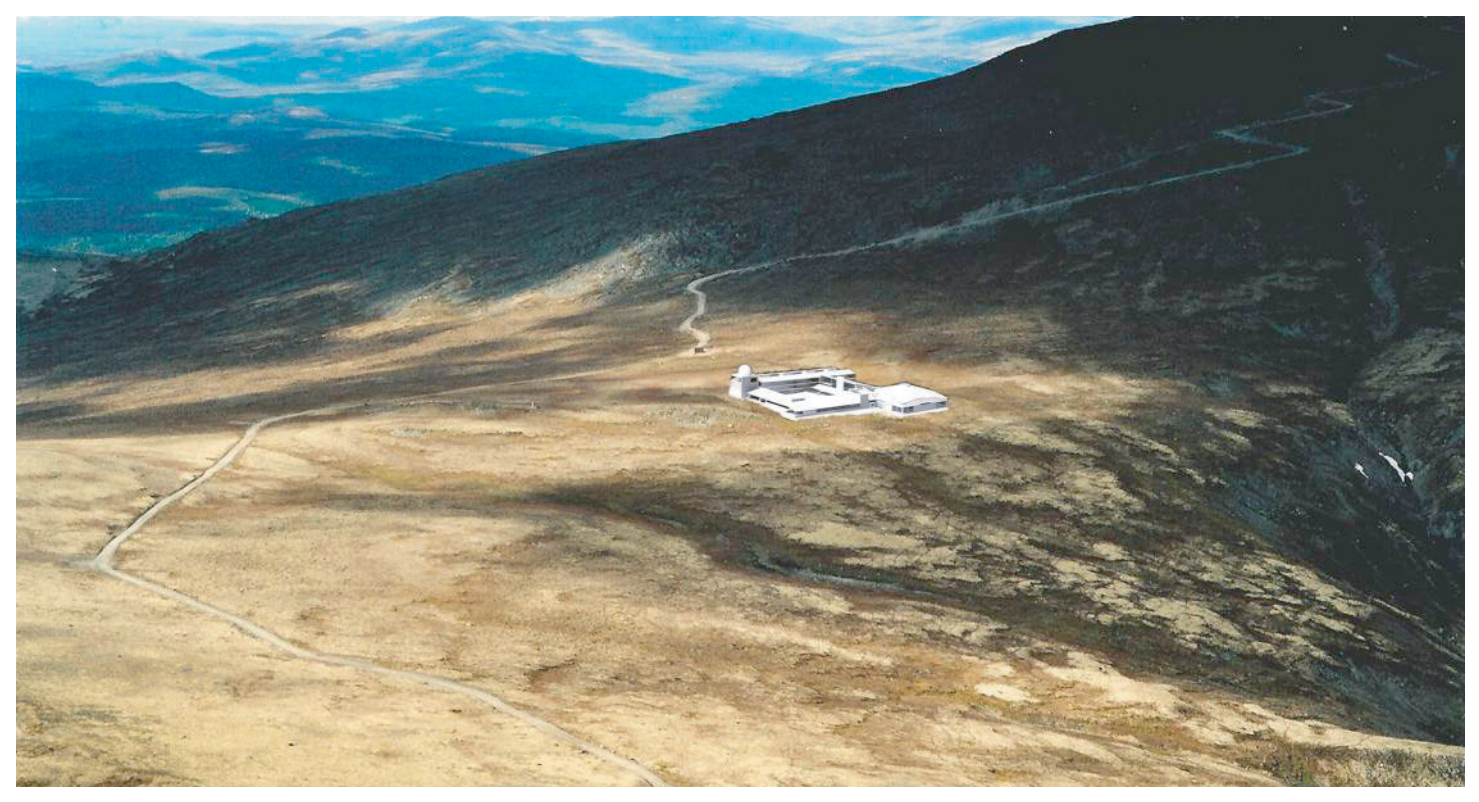
A model of the Mt.Tron University of Peace manipulated into an aerial photo, correctly places on the Peace Plateau.

The time is rapidly approaching when, at last, we can expect to receive clarification that the Foundation actually will be granted the building site and permissions on Mt.Tron for the University of Peace. It might, therefore, be useful at this point briefly to review a project that for various reasons has been underway for a considerable time, as many by now might possibly have lost sight of the broader perspective.