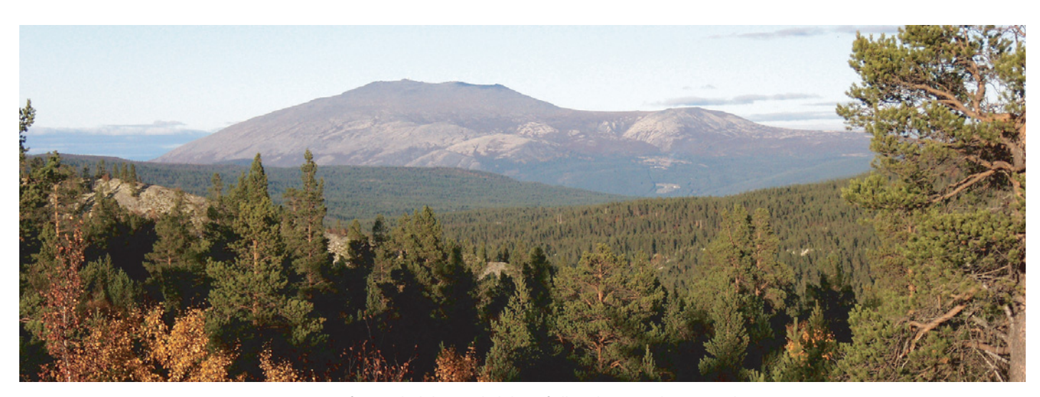
Mt.Tron seen from Sølndalen in Alvdal Vestfjell, 27th September 2007.

Man now lives in a 'global village' and cannot any longer merely follow his lower inclinations and instincts. He has to wake up to his higher qualities and really show what it means to be human - how it is to be able to realize himself fully. In a 'village', where after some time each will know all the others, the individual will have her rightful worth and natural significance. Every human being is a unique manifestation - the only expression of its kind in the infinite display of life. It is a microcosm in a macrocosm, i.e. nothing outside is not already within - inside all of us. Every individual is like a ray from the sun of Life or like a wave on the ocean of the Absolute. We are alike in essence and belong to one another. A World Government originating in the United Nations and its Universal Declaration of Human Rights, with superpowers and revenge forbidden, would today probably be the best start and hope for worldwide political peace and stability in the future.