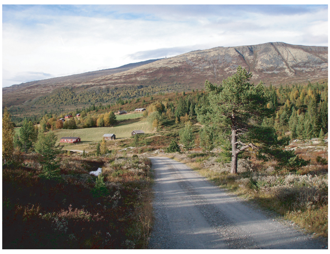
Mt.Tron with the peak (Blåskarven) furthest back and Sørkletten in the foreground, seen from Nysetervangen, 11th September 2007.