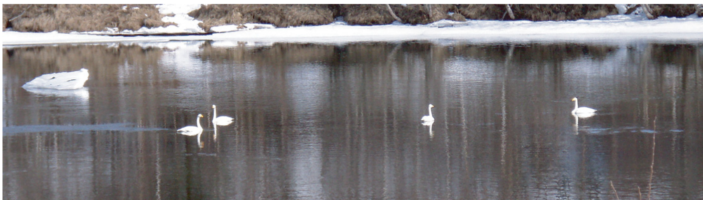
The four Whooper swans from the front side photo, zoomed in three times and enlarged.