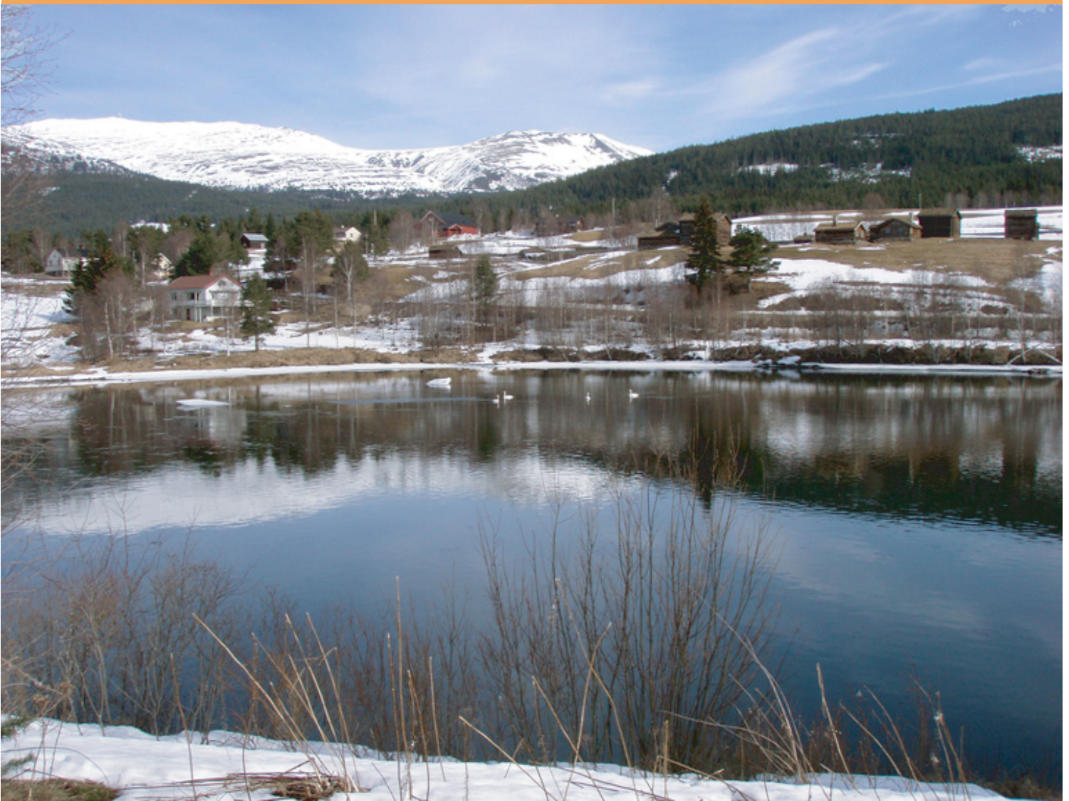
Mt. Tron with the Peace Plateau. In front the river Glomma with four Whooper swans, March 31st 2007.

April 2007 • Mt. Tron University of Peace Foundation • No. 1 Vol. 10