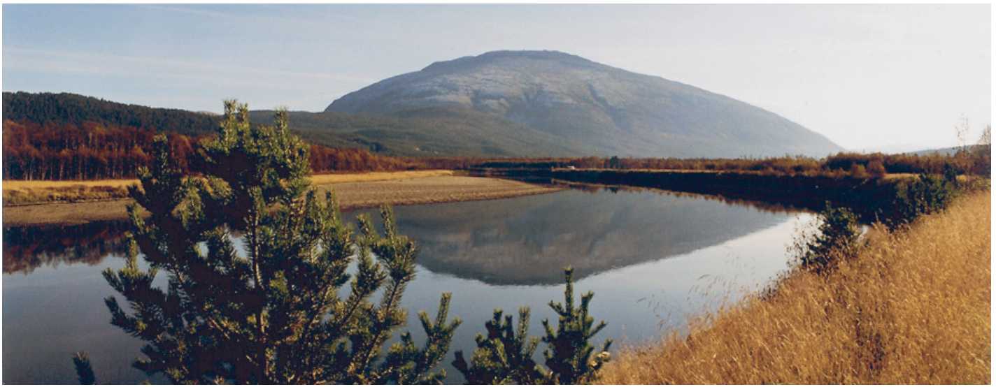
Mt.Tron in late autumn with the river Glomma in front. View from North-West near the village of Tynset.