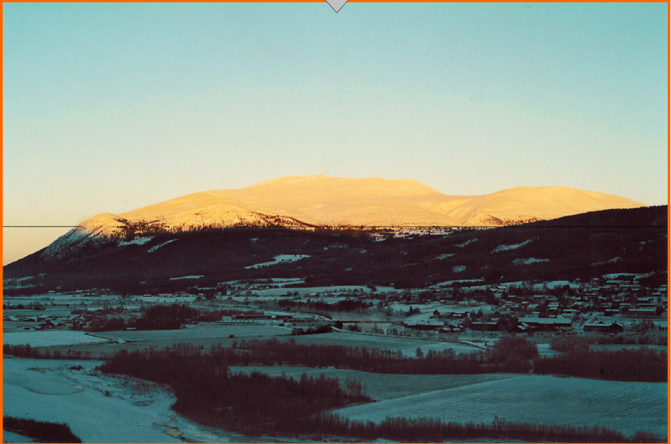
Mt. Tron is bathing in the gold of the evening sun, while parts of the centre of Alvdal lies in the shadow. Seen from SW on the last day of the year, 31st December 2000.

Have you ever considered that all that really means anything to us in this world doesn't cost anything, but is free? These values we don't need to strive for, or compete for, or work ourselves to death to achieve. We only need to give a little of ourselves as humans.