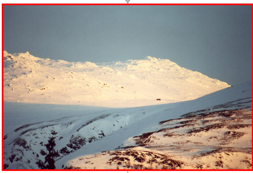
The top of Mt.Tron, seen through a telephoto lens from Tronsvanglia, early morning, medio January 2001.

Still Mt.Tron covered by snow and ice, both literary and in a figurative sense. So far t h e municipality of Alvdal has not managed to live up to their promises about the further development of their planning work, where they, among other things, will arrange for a peace university o n Mt.Tron, accordance with the plans The οf Mt.Tron University of Peace Foundation. And the prospects