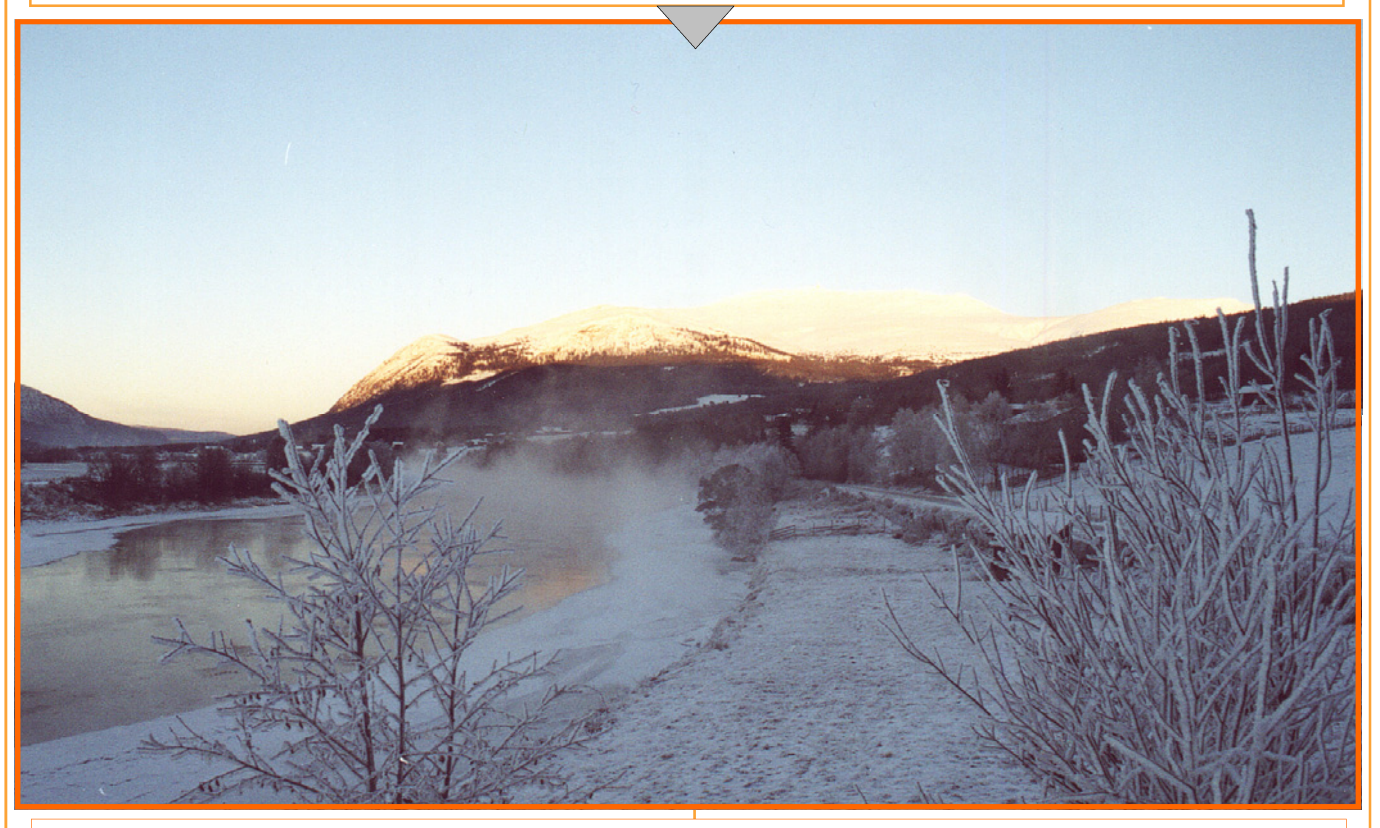
Mt.Tron seen from the bridge over the Glåma river at Aukrustsenteret in Alvdal, New Years Eve the 31<sup>st</sup> of December 2000. It is minus 28 degrees Celcius, and the evening sun is bathing Mt.Tron in gold.

...the 'sun' would shine only on the 'top'. On the 25<sup>th</sup> of March this year I received an e-mail from a Danish friend in Denmark, which seemed to be of that 'wandering type' which one frequently receives to forward to one's friends. The mail was only marked "Week of Friendship". In my opinion it was so good and important that I have chosen to share it with the readers of The Mt.Tron Mail: