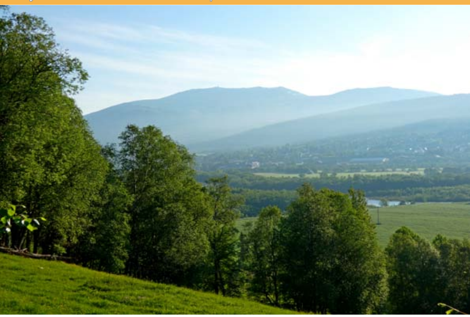
A fine veil of morning mist covers Mt. Tron and the Alvdal valley after a night of rain, at 06:28 on June 17th 2020.

June 2020 * Mt.Tron University of Peace Foundation * No. 1+2 Vol. 23