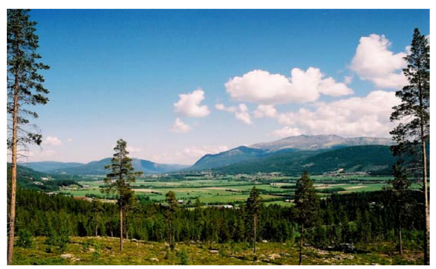
Tronfiell and the Alvdal village as seen from South-West.