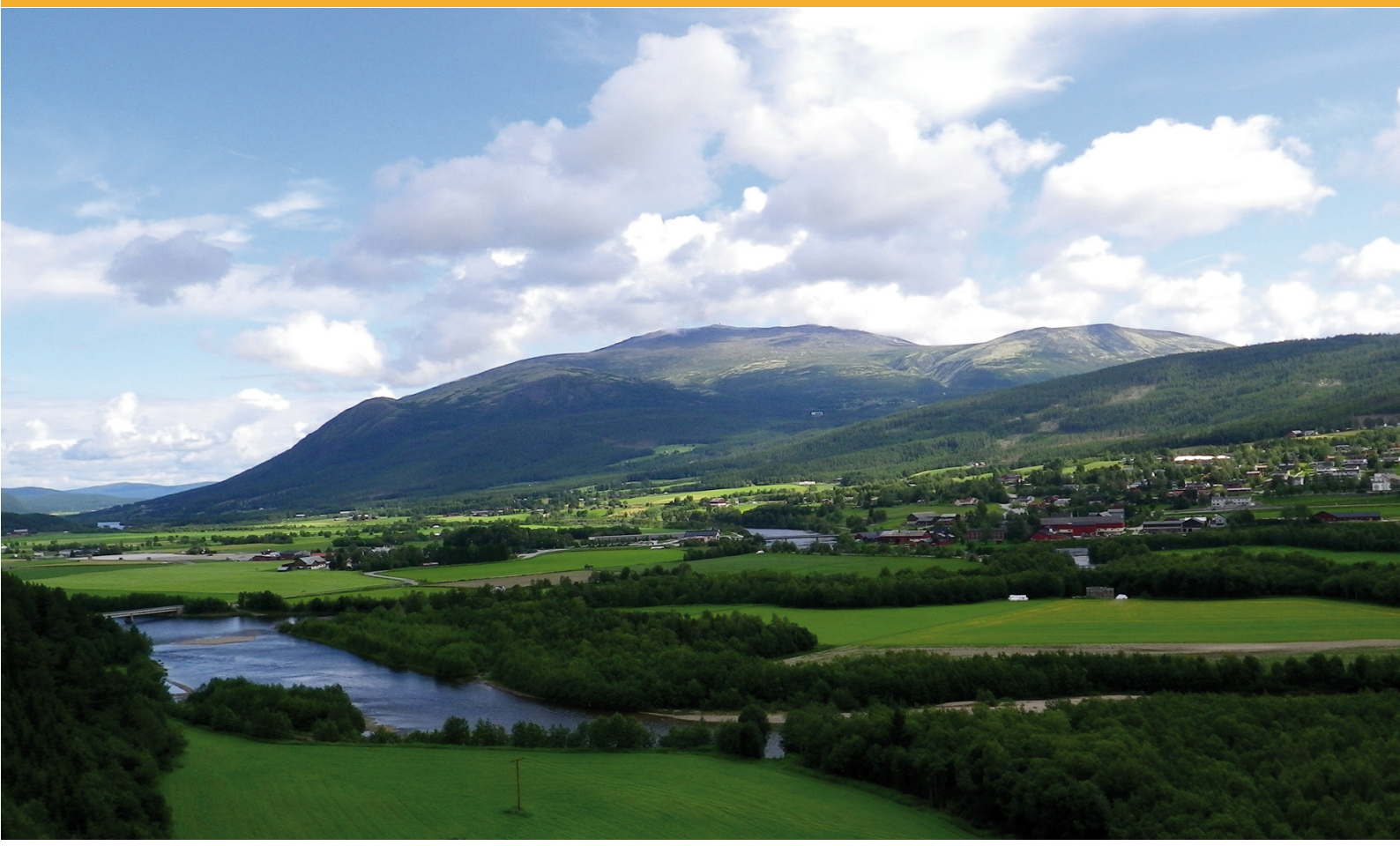
Changing summer weather at Alvdal, 11 July 2011 at 09:57 hrs. Seen from South West.

July 2011 * Mt.Tron University of Peace Foundation * No. 2 Vol. 14