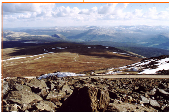
The 'Peace Plateau' (in sunshine) and Sørkletten (in shadow), as seen from the peak of Mt.Tron, primo June -99.

Both the Centre Party and the Left Wing Party of Alvdal have this autumn made a party programme of support to the University of Peace for the coming period of election. This we think deserves great honours, and it certifies both broadmindedness and foresight among their representatives!