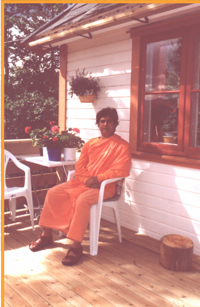
Swami Paramananda at Shantibu in Alvdal, July 98.

Shantibu all of July and during the last weeks of August. In September he will be available weekends up to and including the 20th. Weekends in August and September are reserved for the participants in the courses. (See next pages).