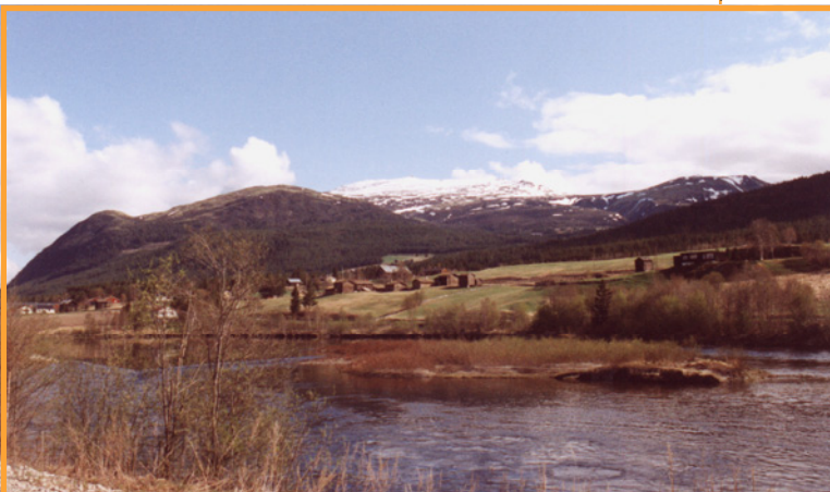
Mt.Tron with the river Glåma in front, May-98.

Alvdal council has now accepted the plans of the Aviation authorities to raise a building of ca. 200 square metres with a 20 metre high tower for radar on the top of Mt.Tron. The building will be made of concrete with insulation and a wooden covering on the outside. The