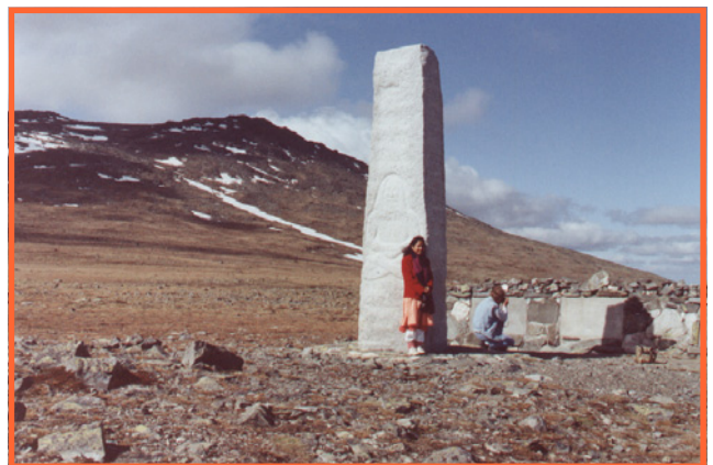
The Monument on Mt.Tron, which is the foundation stone of the University.