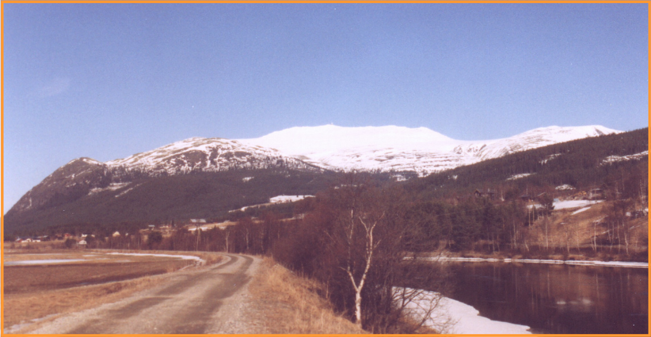
Mt.Tron at Easter 1998, with the Glåma River in the foreground, as seen from the Aukrust Centre in Alvdal.