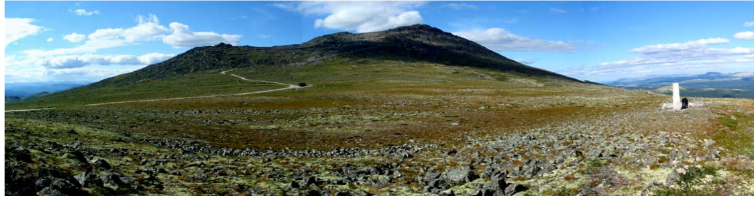
Panorama at the Peace Plateau at the Memorial over Baral and the foundation stone to the University of Peace.