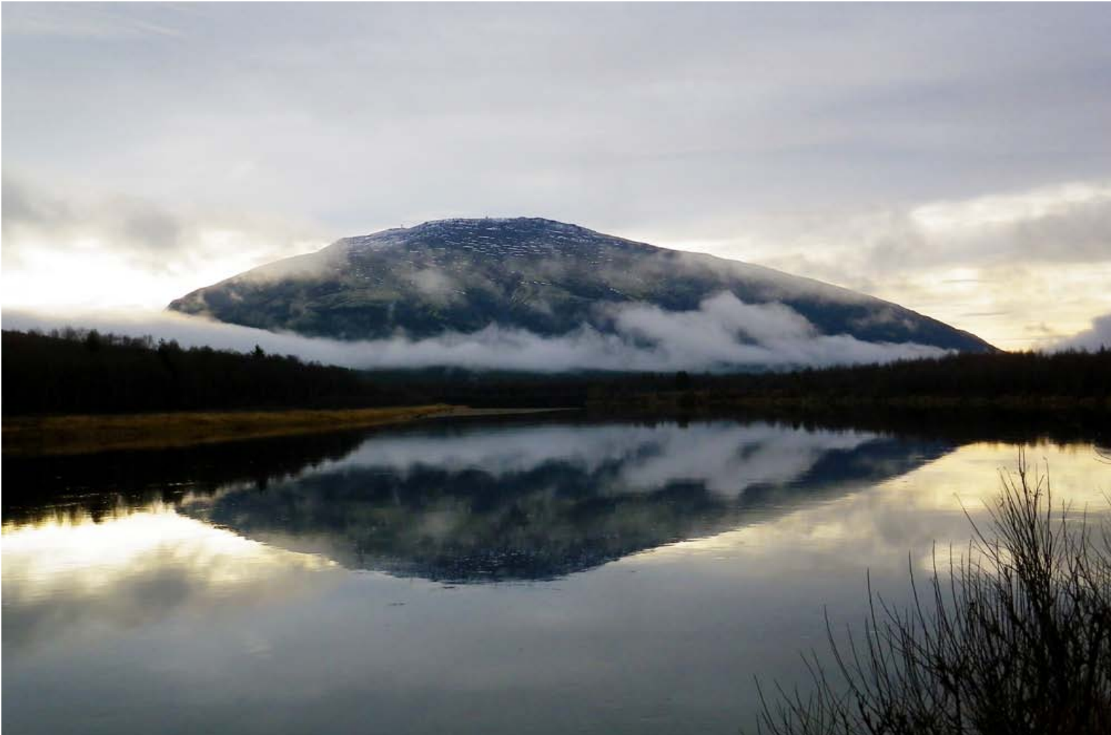
Mt. Tron with Glomma in front, as seen from Tynset, just before the municipal border with Alvdal at Auma, on November 7th 2011 at 10:54 hrs.