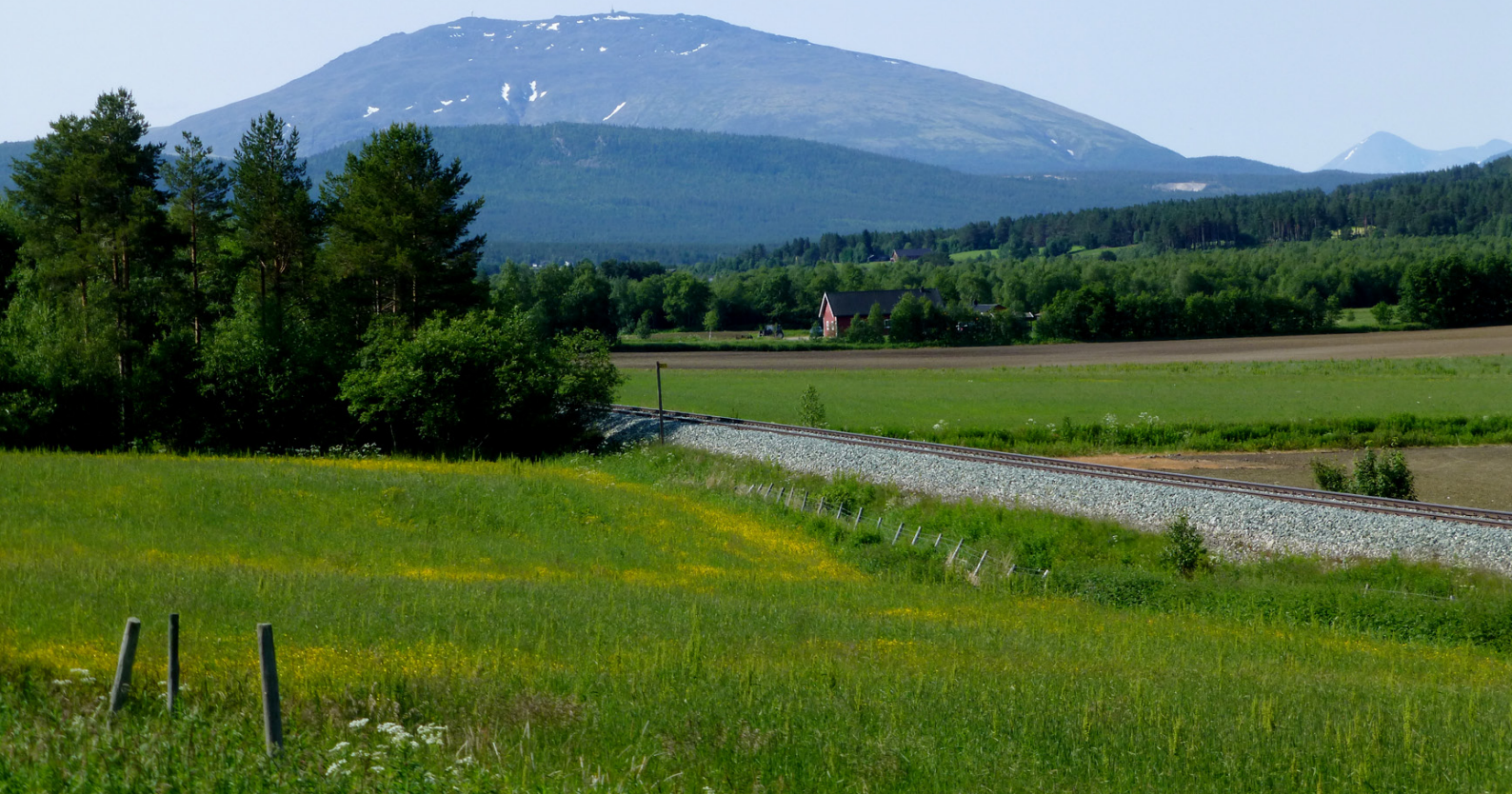
Above: Mt. Tron seen from Telneset, Tynset, 06.07.2013, 14:15 hrs. Furthest to the right on the horizon is seen Mt. Storsølen in Alvdal Vestfjell. Below: Mt. Tron seen from Sølndalen in Alvdal Vestfjell, 03.10.2013, 19:58 hrs.