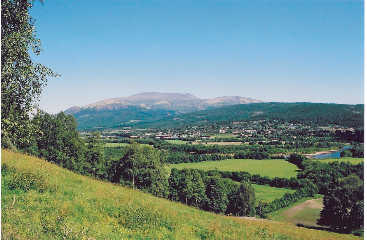
Mt. Tron with parts of the village of Alvdal in the foreground. View towards North-East. Photo: BP, summer 2003.

September 2003 • Mt. Tron University of Peace Foundation • No. 3 Vol. 6