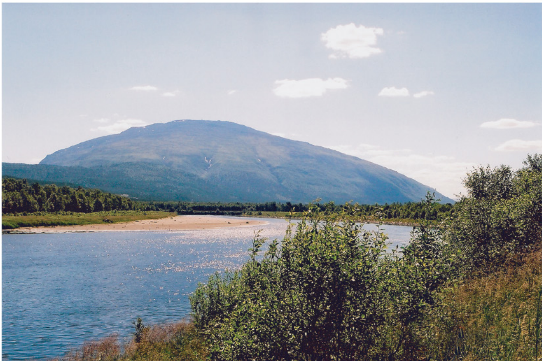
Mt. Tron seen from Tynset with the river Glomma in the foreground, a warm summer day in 2003.

Address: "Shantibu", 2560 Alvdal, Norway Phone & Fax: +47 62 48 78 56 E-mail: shanti@tronuni.org WEB: www.tronuni.org Postal giro account: 0809 2227007 Bank account: 1895.26.50935 Sparebanken Hedmark, Norway SWIFT: SHEDNO22ALV