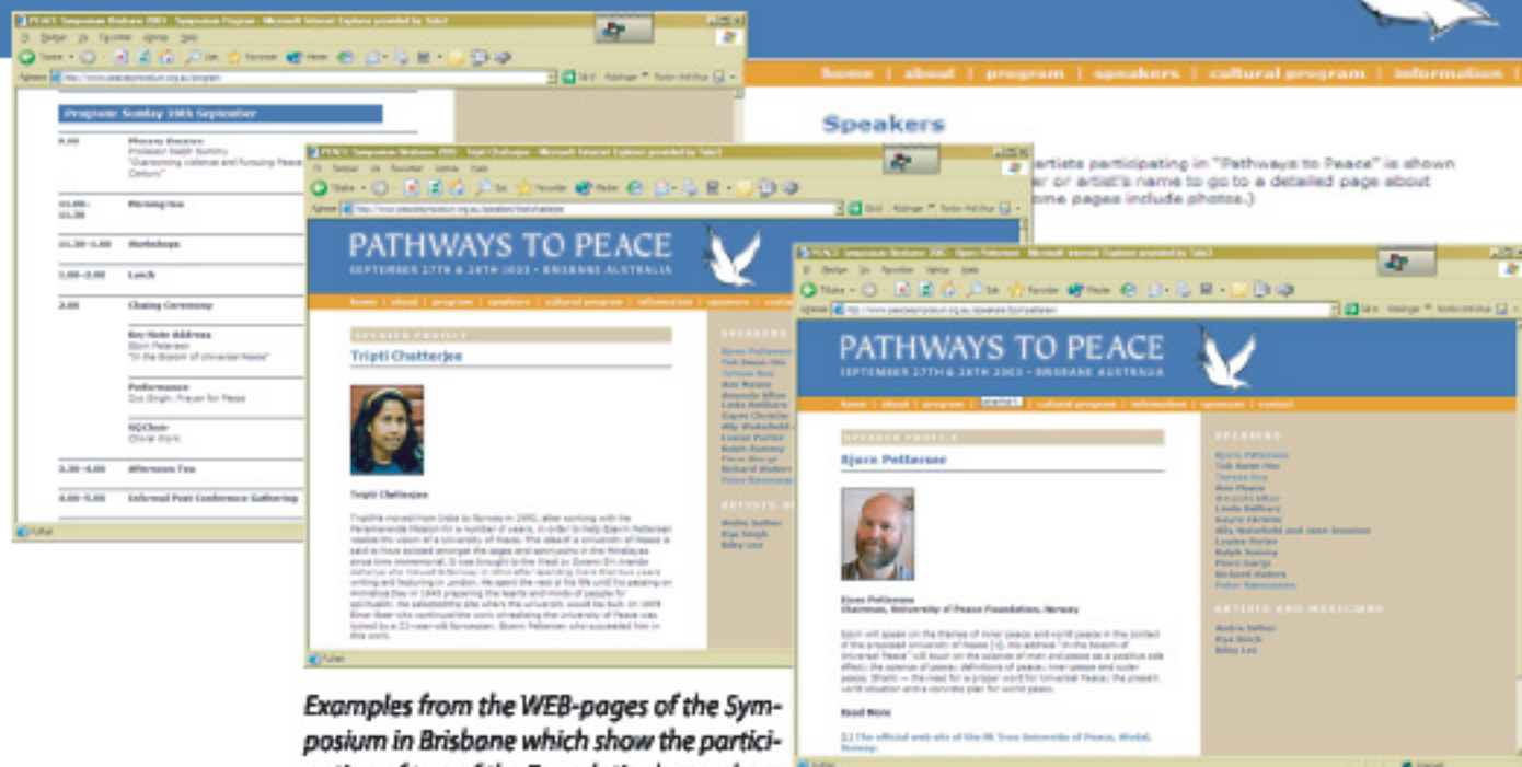
Examples from the WEB-pages of the Symposium in Brisbane which show the participation of two of the Foundation's members.